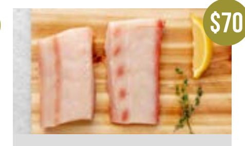
(10 lb.) 4 oz. Mahi Mahi Fillets