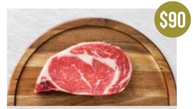
(12) 9 oz. Black Angus Ribeye Steaks with Rastelli Signature Seasoning $7.50 PER STEAK