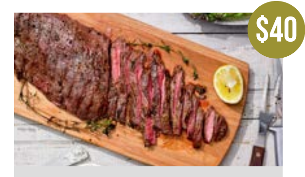
5 lb. Marinated Skirt Steaks (Fajita Meat) $8 PER LB.