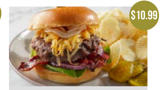
(6) 5.33 oz. Beef Bacon Cheddar Burgers $2 PER BURGER