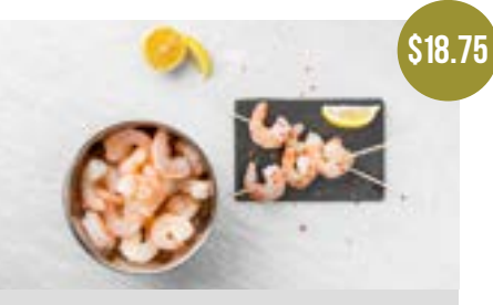
(2) 2 lb. Raw Domestic Gulf Jumbo Wild Caught Shrimp 16/20 Peeled & De-veined Tail On