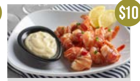
(1) 1 lb. Bacon Wrapped Shrimp (30 Count)