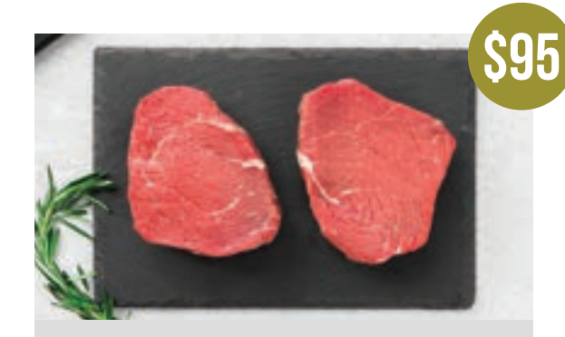
(16) 10 oz. Beef Sirloin Steaks $5.94 PER STEAK