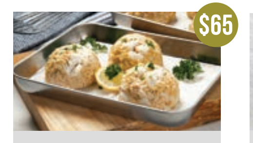
(12) 4 oz. Crab Cakes $5.42 PER CRAB CAKE