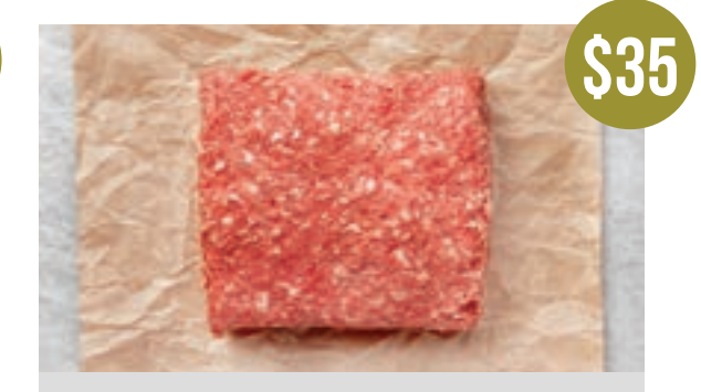
(8) 1 lb. Lean Ground Beef, 80% Lean $4.37 PER LB.