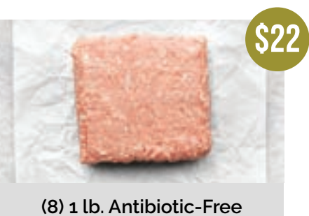
Ground Turkey $4.37 PER LB.